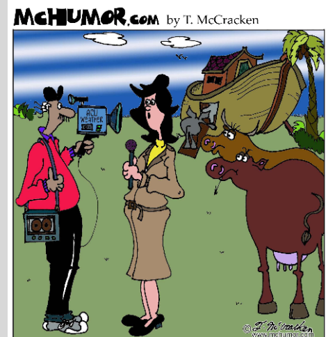
"Although the Weather Service hasn't predicted rain, certain indicators can't be ignored."